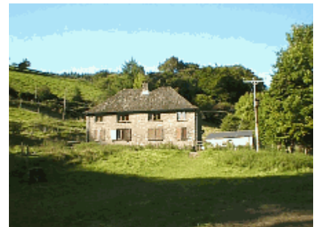
TY-HIR ACTIVITY CENTRE

A Payphone is installed - 01873 890393 - THE COIN BOX IS EMPTIED EVERY WEEKEND AND PHONE REMOVED WHEN HOUSE EMPTY.