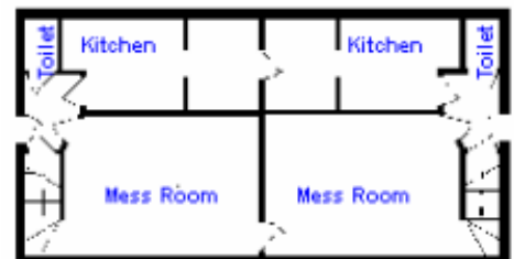
Ger y Ffordd Glan yr Afon